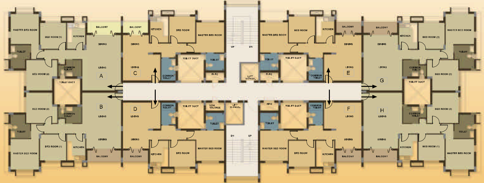
8 MODULE FLAT

Saleable Area A, B, G, H - 3 BDR - 1332 Sq.ft. C, D, E, F - 2 BDR - 1010 Sq.ft.